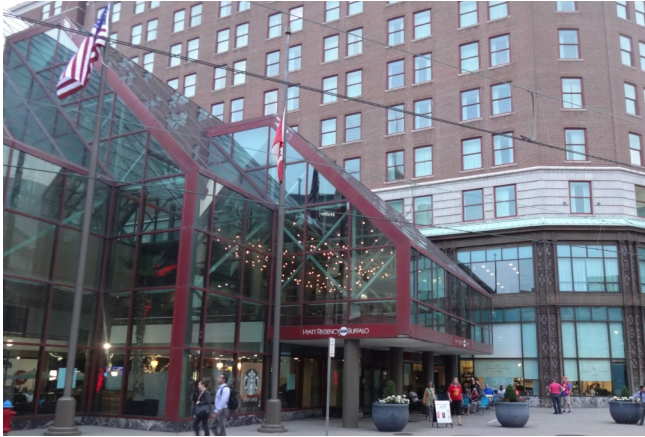
(above) The main Convention Hotel

In August we had the National Convention, this year hosted by the Department of New York and what a convention it was. With 7 hotels set up for us, and at least 4 of them fully booked. It was a blast. it was a long ride from Staten Island, but it was really worth the visit. There was something going on everyday.