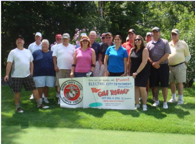
Electric City held their 8th annual golf outing on August 4th. Among many hole sponsor's and gifts donated, $500 Gift was donated from the local supermarket for a hole in one. Close but not close enough