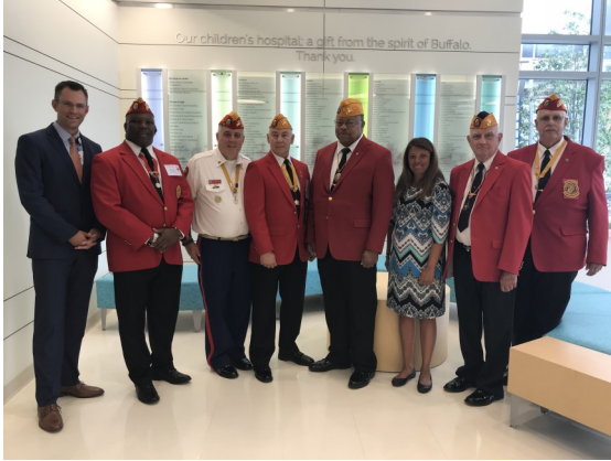
The Kennel along with the Pack of New York presented a check for $40,000 to the local children's hospital in Buffalo.