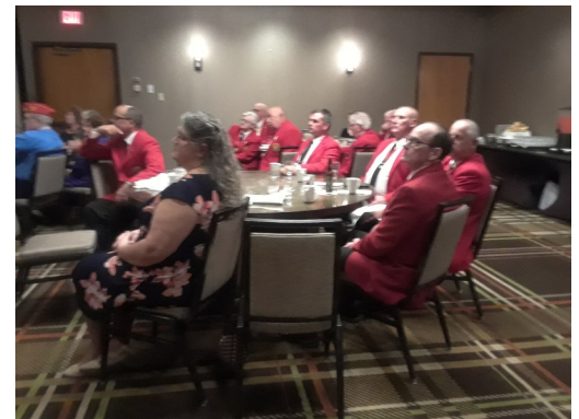
(above), members listen to our speakers at the Banquet. Well, not everyone was fully attentive, but that's OK.