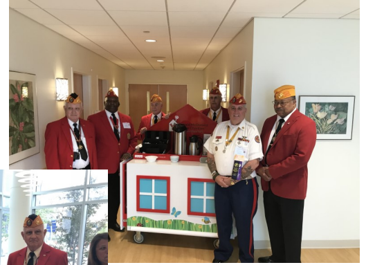
(Center) The hospital CFO accepting the check from the Chief Devil Dog Spicer. This was made up of donations from Pounds and Packs all over the county