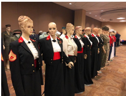
(left) It was also the 100th Anniversary of the women Marines and the uniforms were on display.