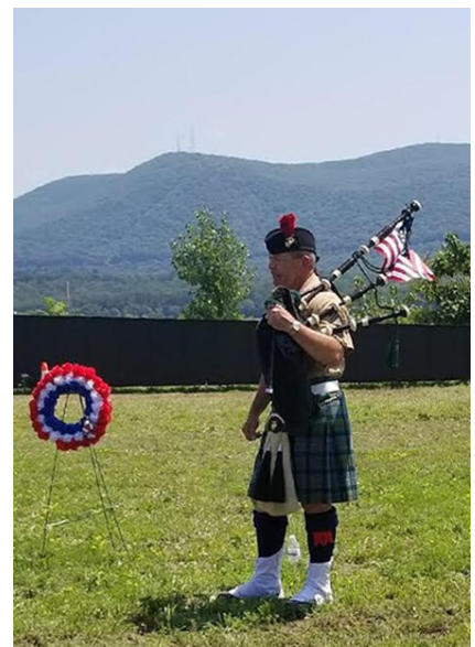
(right) A piper plays taps at the wall.