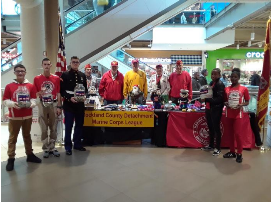
(Top left) Rockland County Detachment at the Palisades Mall along with the local JROTC. Nothing like advertising the league AND collecting toys.