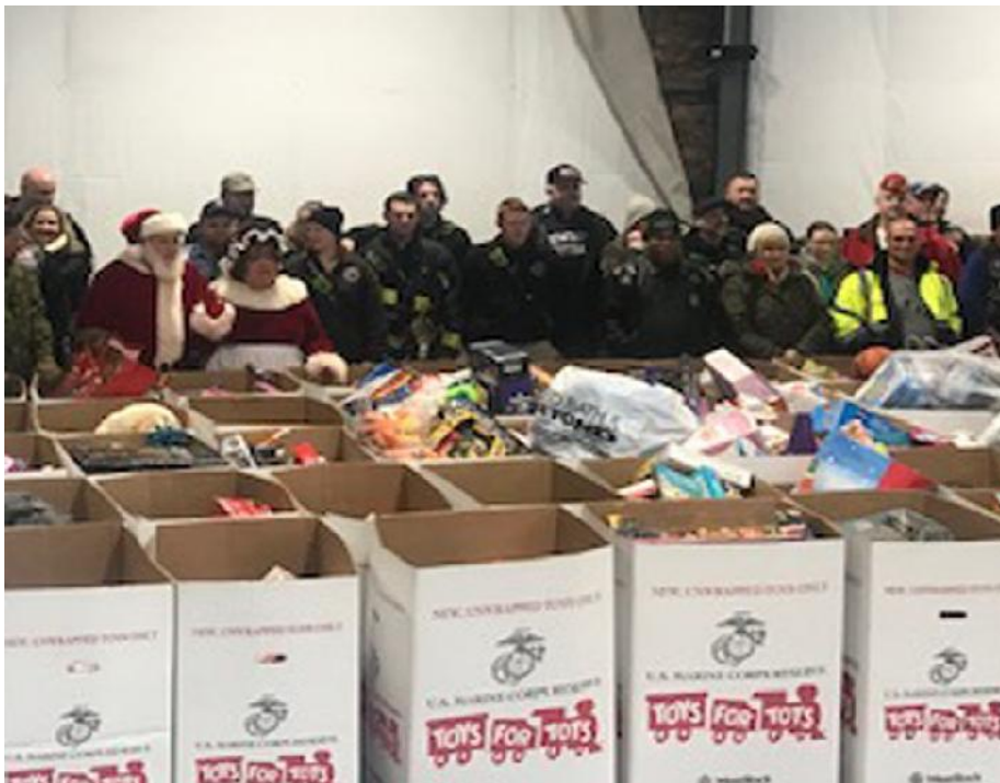
(Above) A small portion of all the toys Brooklyn#1 Detachment collected this year.