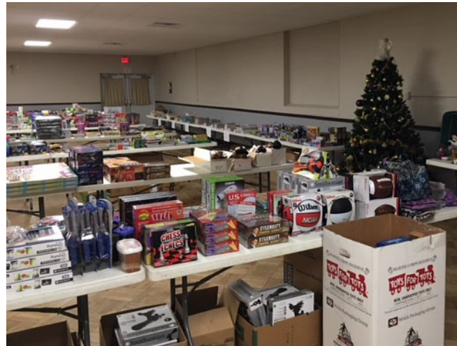
The pictures was the setup for Northern Tioga Rural Ministries on the night of our Detachment meeting. The following night the children came in.