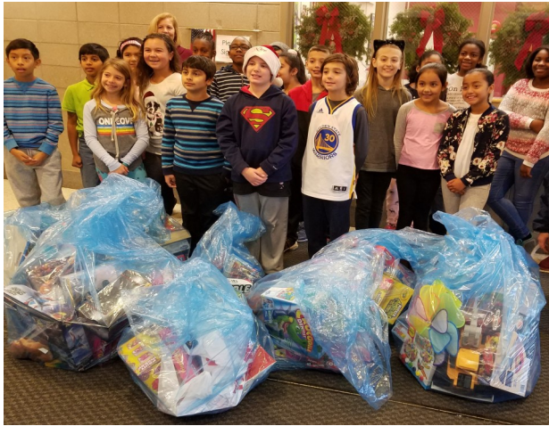
(Top) Students at the Kensico Middle School, Valhalla, NY showing off the toys they collected to benefit Toys for Tots.