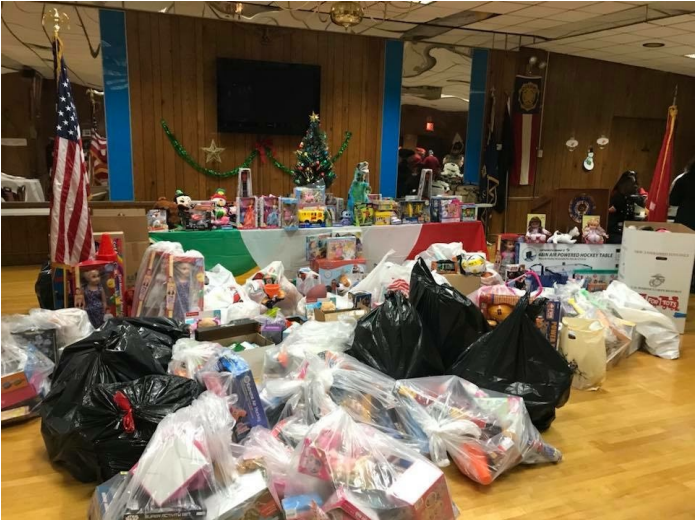
(above) North Shore Queens Detachment in working with local law enforcement gathered many toys for kids in their area.

Here are some photos from various Toys for Tots drives all around the Department. This is a project the league has been helping the Marine reserve units with for years and is a very good cause. If you helped out, we thank you and if not think about next year. I am sure the kids getting the toys, thank you as well.